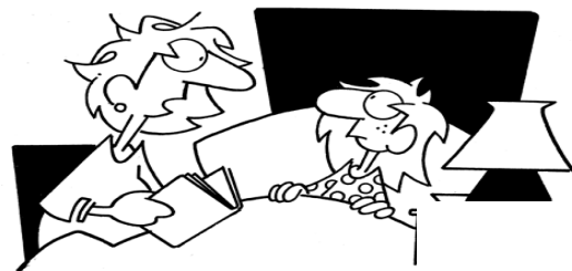
"Yes, the disciples followed Jesus... but not on Twitter."