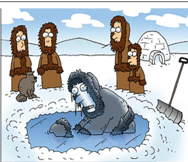
ANOTHER ESKIMO BAPTISM GONE BAD