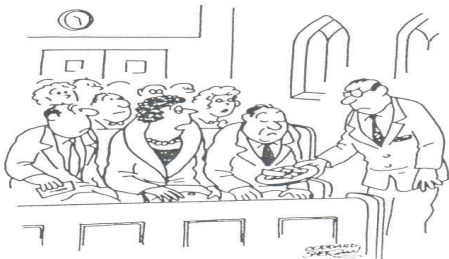
"WAKE UP, DEAR, AND STOP MUMBLING 'I GAVE AT THE OFFICE.'"

NO BIBLE HOUR TONIGHT (due to Spring break)