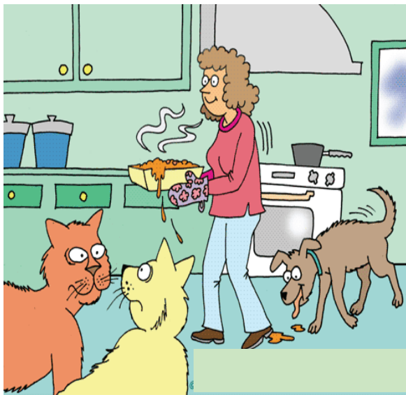
Tabby & Fluffy suddenly realize the secret to mom's spotless looking kitchen floor. . .

Roselee Carwell Phone # Change 903-221-5577